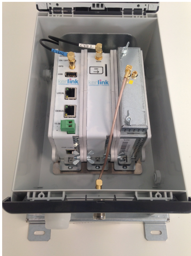
Wirnet™ iBTS Compact