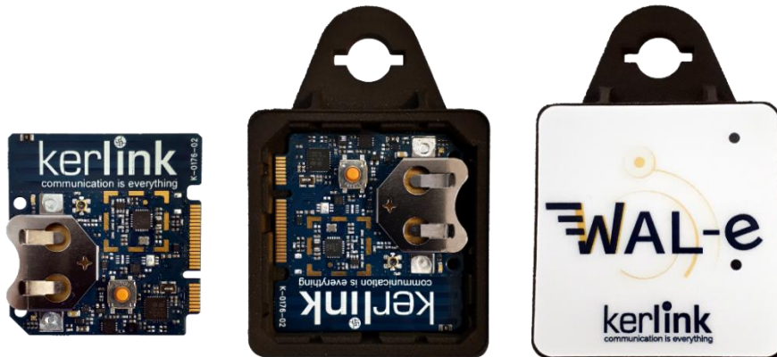
Figure 1: Kerlink WAL-e hardware